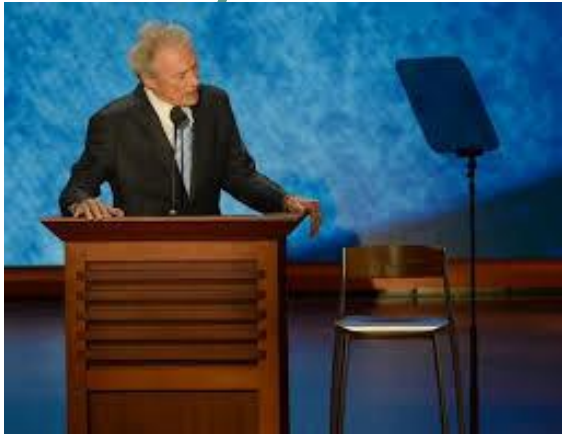
Clint Eastwood at Republican National Convention 2012