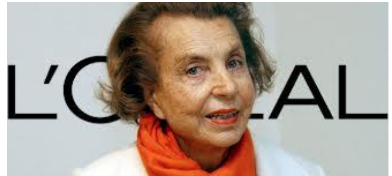
Madame Liliane Bettencourt of L'Oreal